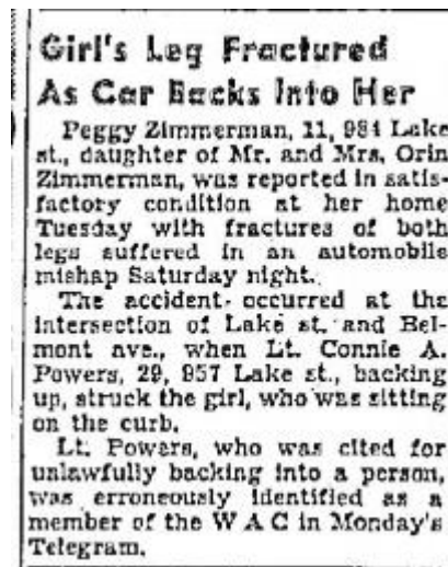
Left: "Salt Lake Tribune" (Salt Lake City UT) Monday 3 Dec 1945 p 14 and right: "Salt Lake Telegram" (Salt Lake City UT) Tuesday 4 Dec 1945 p 12