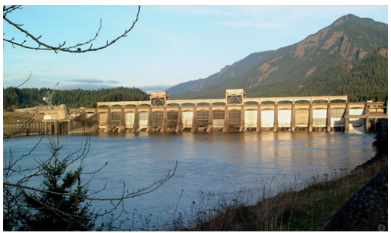
The Bonneville Dam, 40 miles east of Portland OR, on the Columbia River - https://www.nwp.usace.army.mil/bonneville/