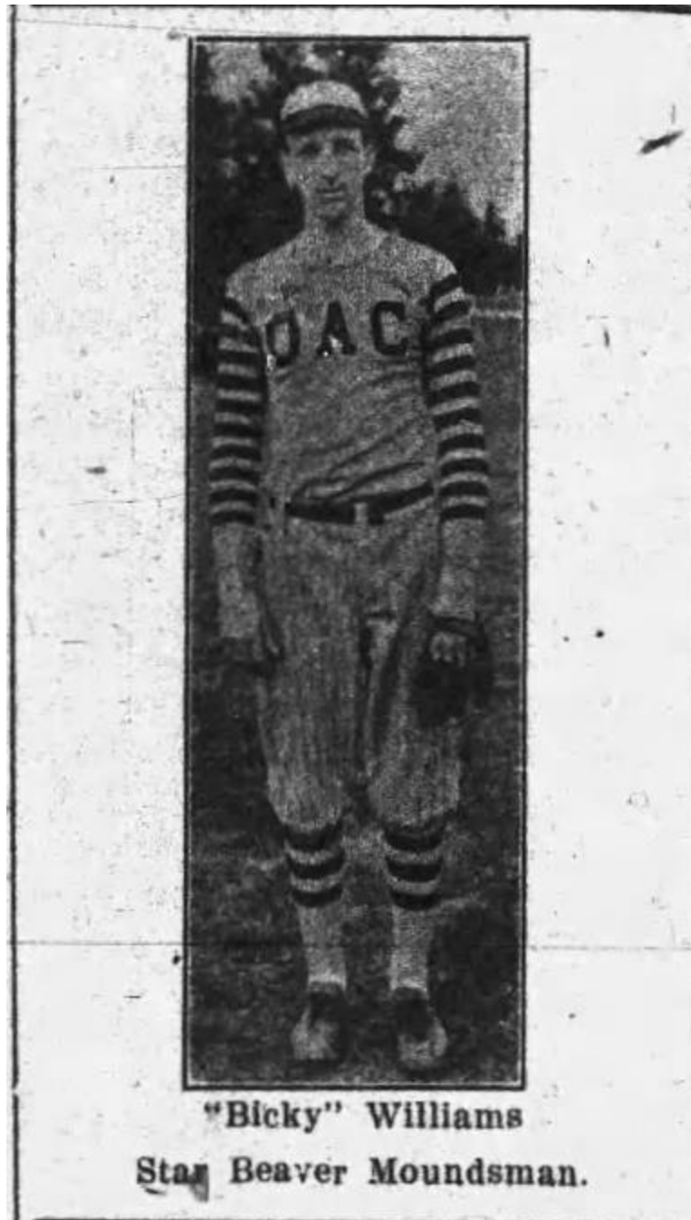
"Corvallis (OR) Gazette-Times" Tuesday 20 Apr 1915 p 2