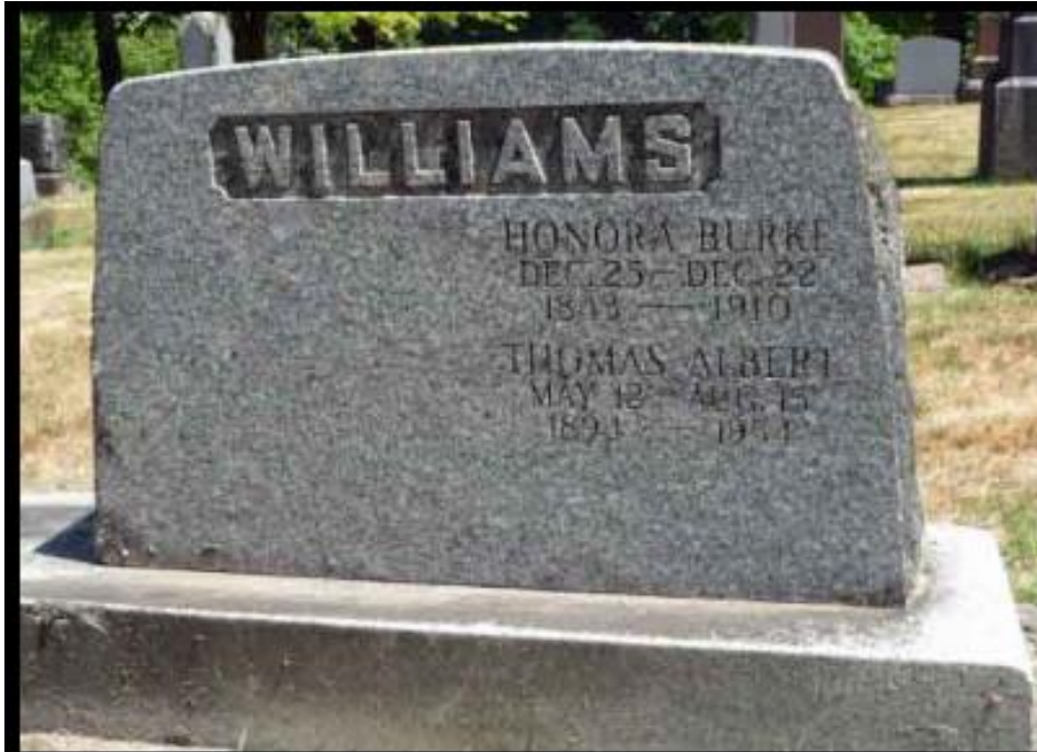
Reverse of tombstone in Mount Calvary Cemetery –