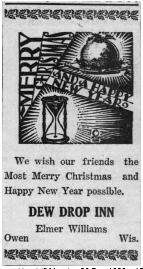
Is this him? "Marshfield (WI) News-Herald" Monday 23 Dec 1929 p 13

Abbotsford WI news: "Marshfield (WI) News-Herald" Thursday 23 May 1929 p 6