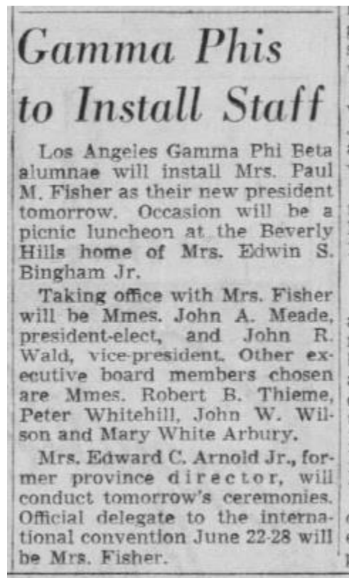
"Los Angeles Times" Sunday 11 Jun 1950 p 101