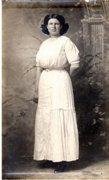
Pearl White - https://www.ancestry.com/mediaui-viewer/tree/24489102/person/26434707137/media/e4e6ba25-9d29-4862-af40-c3873b99baa8