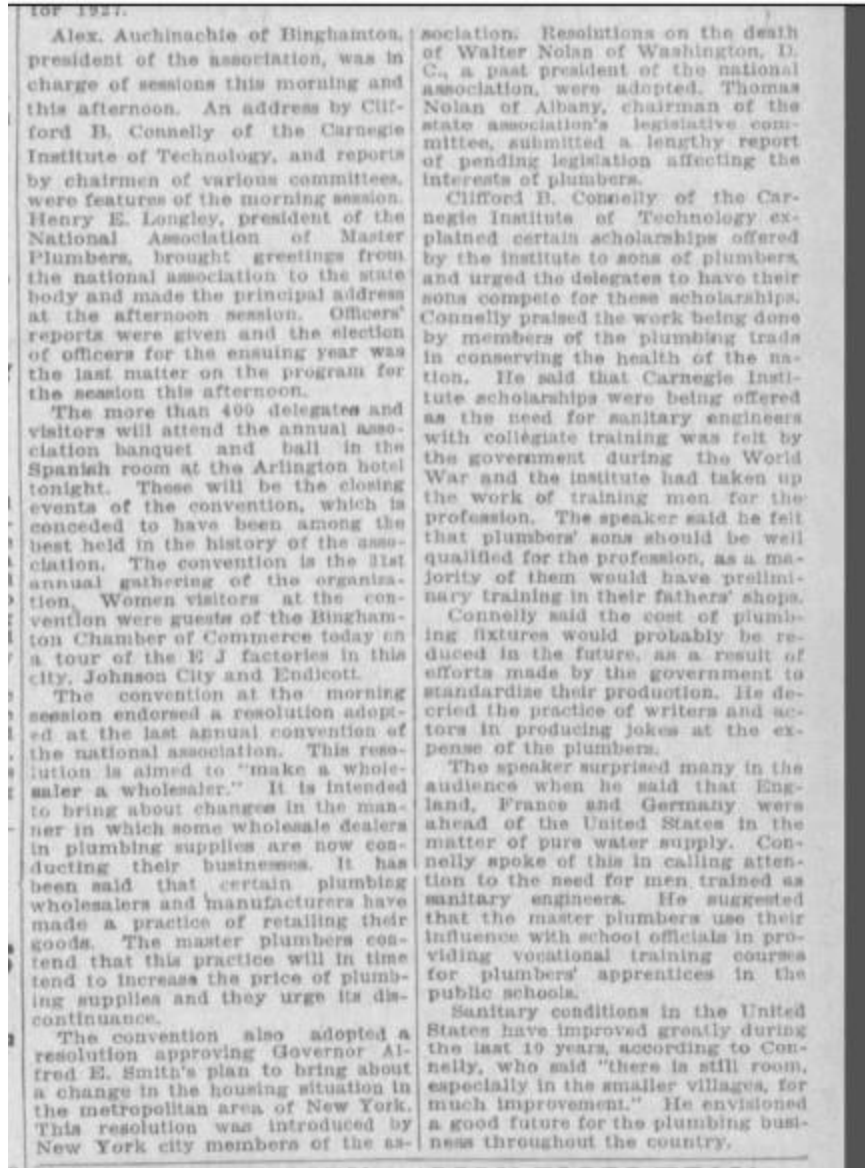
Photograph of father at top left - "Binghamton (NY) Press & Sun-Bulletin" Wednesday 24 Mar 1926 p