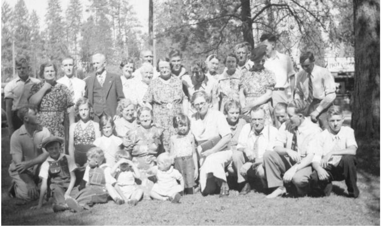
Flemming-Waddell family – Find A Grave 36494526