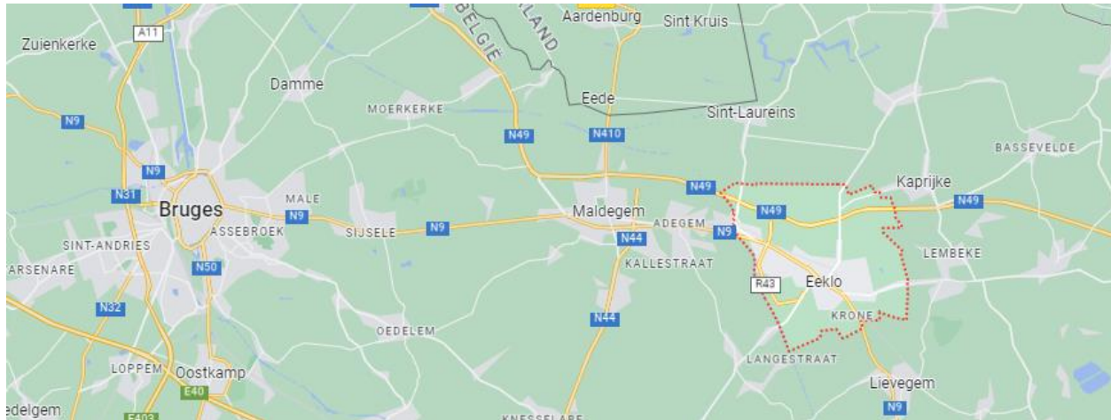
Eeklo, East Flanders, Belgium -

https://www.google.com/maps/place/9900+Eeklo,+Belgium/@51.1832589,3.3259268,11z/data=!4m6!3m5!1s0x47c3641fd3ee32b3:0x40099ab2f4d5070!8m2!3d51.1851666!4d3.564071!16zL20vMDE0OGs0