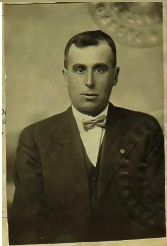
US Passport Application, sworn on 5 Sep 1924, filed 8 Sep 1924 - https://www.ancestry.com/discoveryui-content/view/1704917:1174?tid=&pid=&queryId=de3695dcf37d5203e622d0505f10cea6&_phsrc=hFB64282&_phstart=successSource