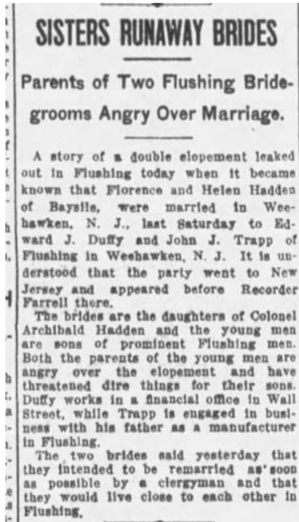
"Brooklyn Daily Eagle" Sunday 22 Feb 1914 p 69