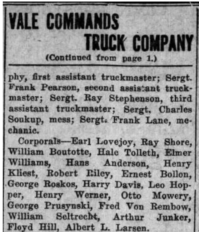
Excerpt – “Kenosha (WI) News” Wednesday 24 Oct 1917 p 5