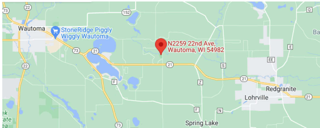
Location of Lake Alpine near Wautoma WI -

https://www.co.waushara.wi.us/facilityview.aspx?fid=45&id=44906&catid=0