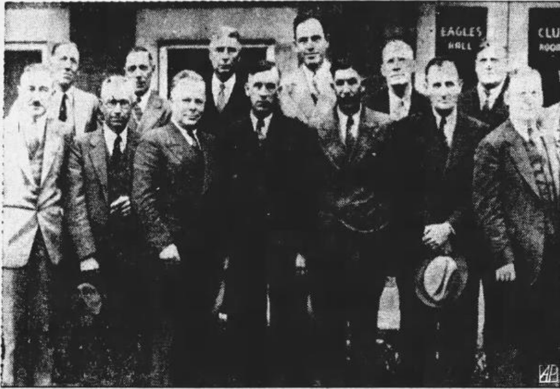
WISCONSIN DAIRY INDUSTRIES ASSOCIATION