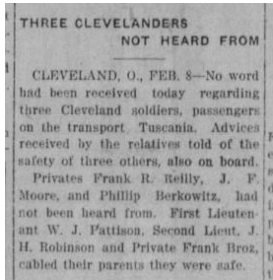
First name spelled PHILLIP - "Cleveland (OH) Tribune" Friday 8 Feb 1918 p 5