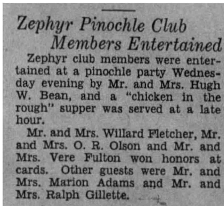
"Twin Falls (ID) News" Saturday 20 Sep 1941 p 5