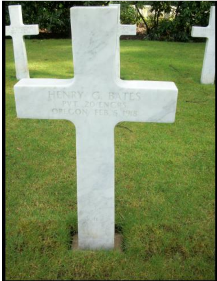
Find A Grave 56503104