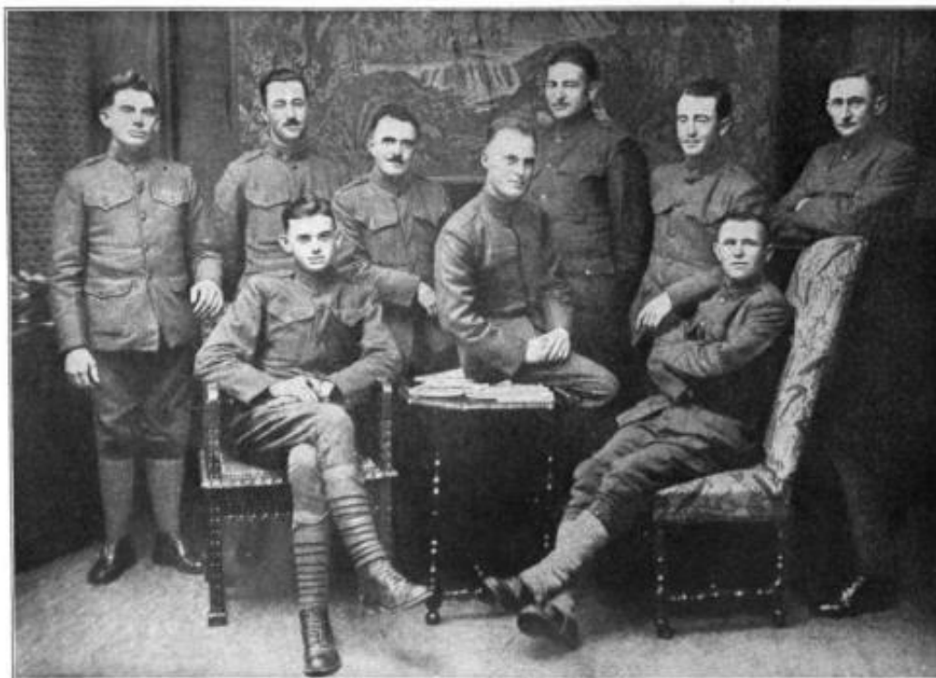
THESE ARE BOYS OF THE LONG-BELL LUMBER COMPANY WHO WERE ON THE ILL-FATED TUSCANIA THESE ARE BOYS OF THE LONG-BELL LUMBER COMPANY WHO WERE ON THE ILL-FATED TUSCANIA

"Each one of the Long-Bell boys who are identified in