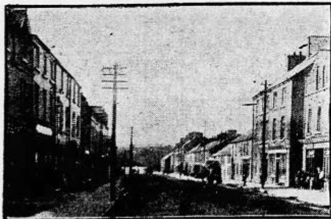
Street scene in Bunrana, County Donegal, where many Tuscania survivors, including Fred O. Barger, of Decatur, were landed.