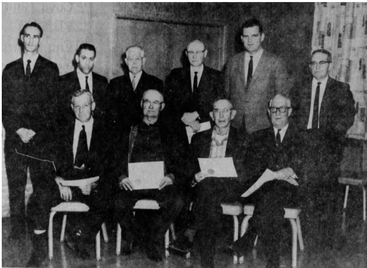
"Bedford County Press & Everett (PA) Press" Thursday 30 Mar 1969 p 15