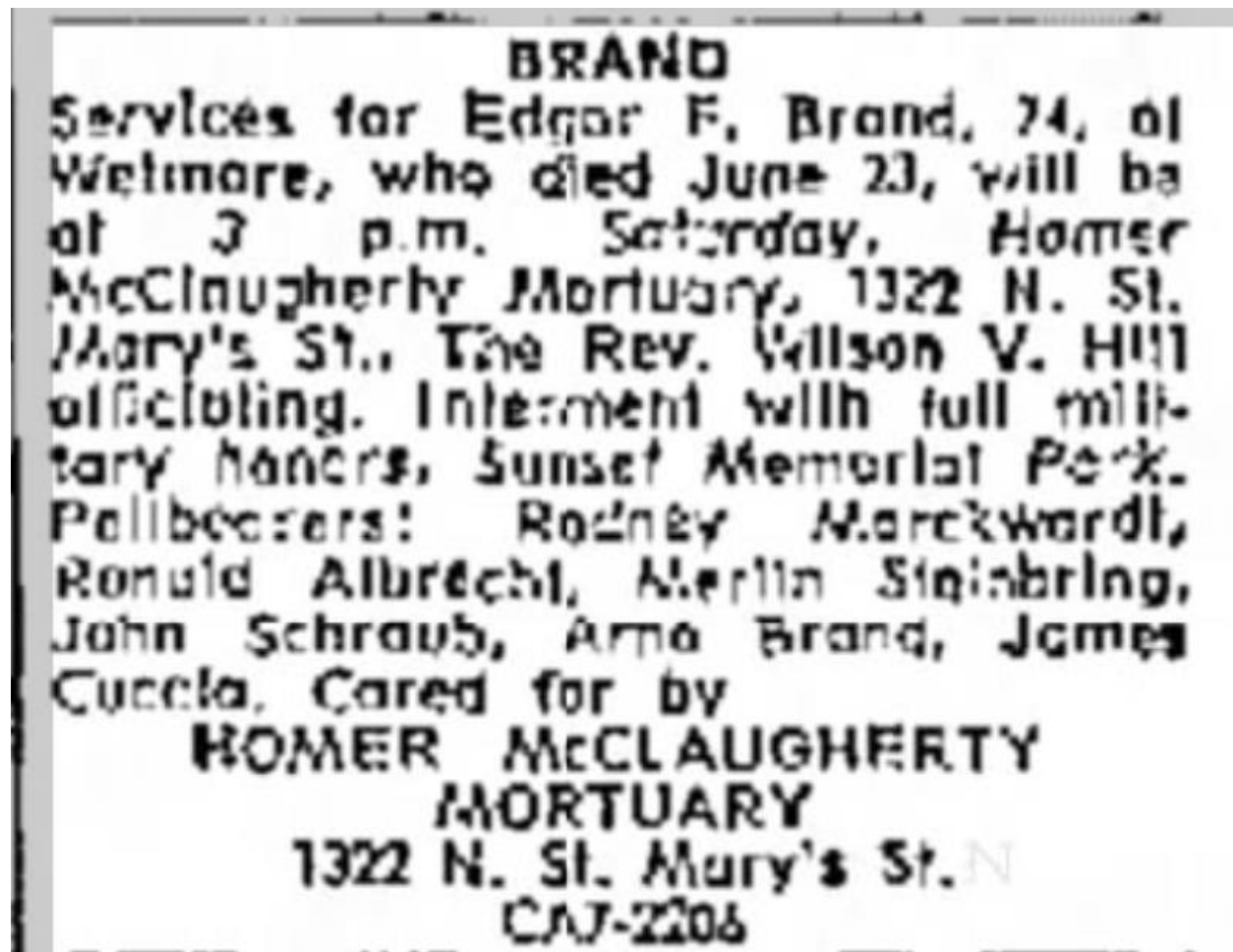
"San Antonio (TX) Express & News" Saturday 25 Jun 1966 p 24