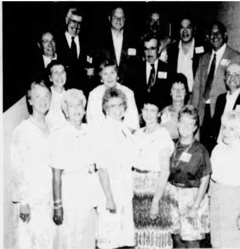
Harbor Springs High School Class of 1954