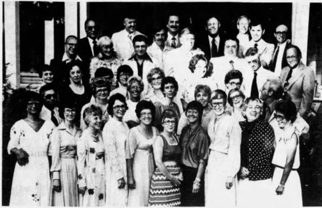
"Petoskey (MI) News-Review" Thursday 16 Aug 1979 p 4

A potluck picnic was held on Sunday at the old Five Mile Creek School for members of both classes and their families.