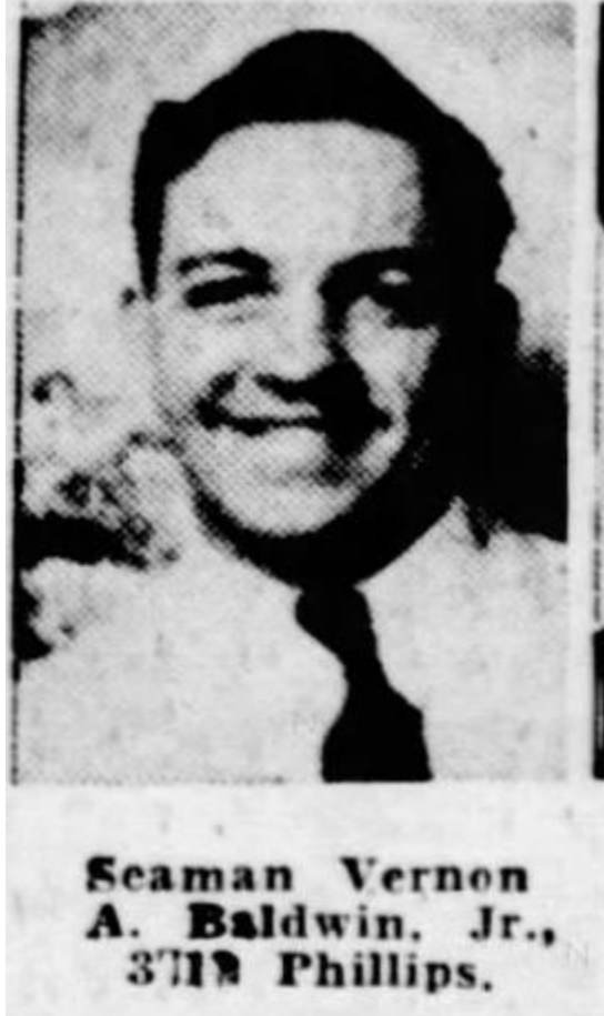
"St. Louis (MO) Star & Times" Monday 20 Apr 1942 p 17