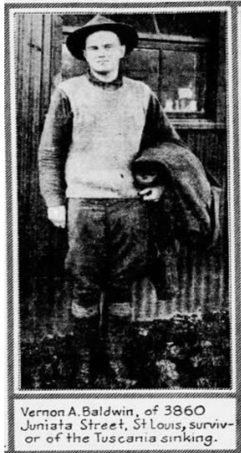
"St. Louis (MO) Post-Dispatch" (The Daily Magazine section) 21 Mar 1918 p 17 - https://www.newspapers.com/image/139223517/