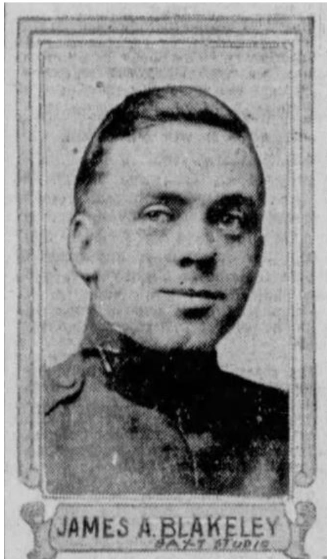
"Brooklyn Daily Eagle" Saturday 9 Feb 1918 p 2 - https://www.newspapers.com/image/57090019/