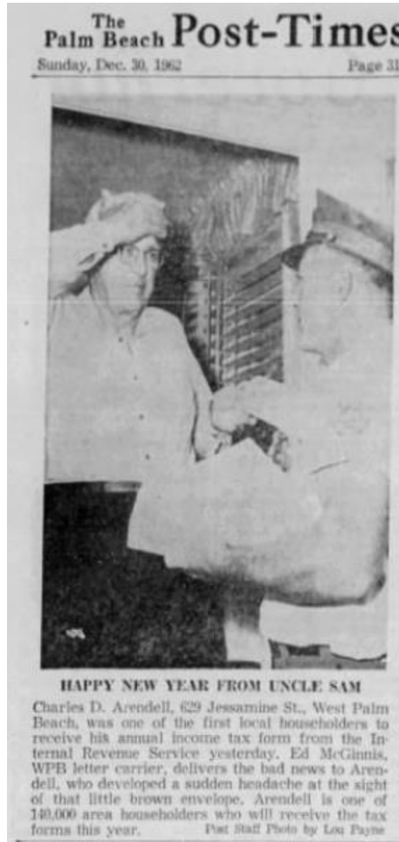
“Palm Beach (FL) Post” Sunday 30 Dec 1962 p 31 - https://www.newspapers.com/image/133909968/