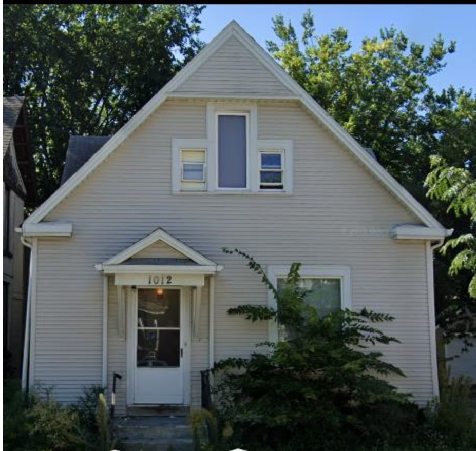
1012 – 18 ½ St. NE, Minneapolis MN – built 1900 - https://www.zillow.com/homedetails/1012-18-1-2-Ave-NE-Minneapolis-MN-55418/1804782_zpid/