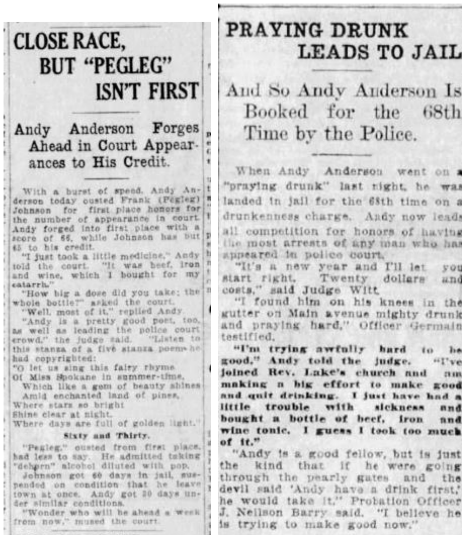
Is this him? – left: “Spokane (WA) Chronicle” Saturday 30 Oct 1920 p 6 – right: “Spokane (WA) Chronicle” Saturday 22 Jan 1921 p 1