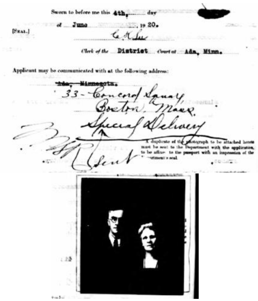
US passport application of Fred's parents – 4 Jun 1920 – "to visit the grave of my son" – to sail from Montreal, Canada, on "Saturnia" on 17 Jul 1920 -

https://www.ancestry.com/imageviewer/collections/1174/images/USM1490_1288-0443?pld=450374421