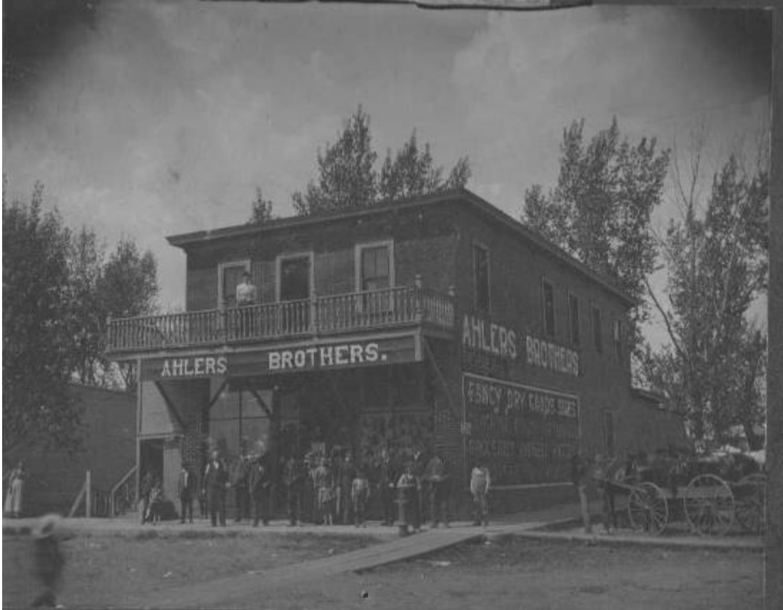
The Ahler Brothers store, Stewart, McLeod MN - https://www.ancestry.com/mediaui-viewer/tree/75106829/person/232081809217/media/ae7bd8e3-91ca-4022-b83a-afc4d3eec8b5